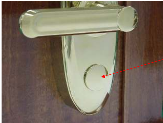
Emergency key cover